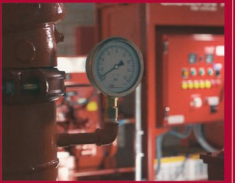
Grundfos provides complete solutions, encompassing pumps, driver, control panels, gauges and other accessories.