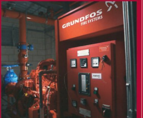
All control panels are custom-built according to system requirements and specifications.

All Grundfos fire protection systems are custom-built in close cooperation with each individual customer. We work diligently with you to be sure your solution is compliant with the rest of the system and all local approvals.